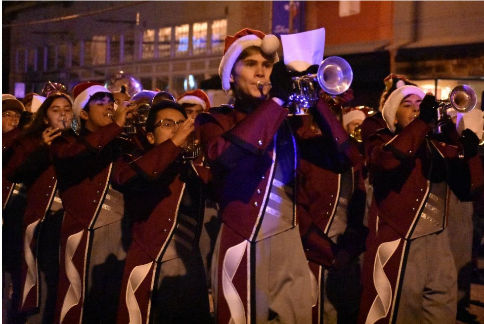
The Sherman High School Band marching, while playing in the annual Christmas parade

The Paw Print staff would like to wish everyone a safe Merry Christmas and Happy Holidays! Enjoy our list of the Top 5 Christmas songs!