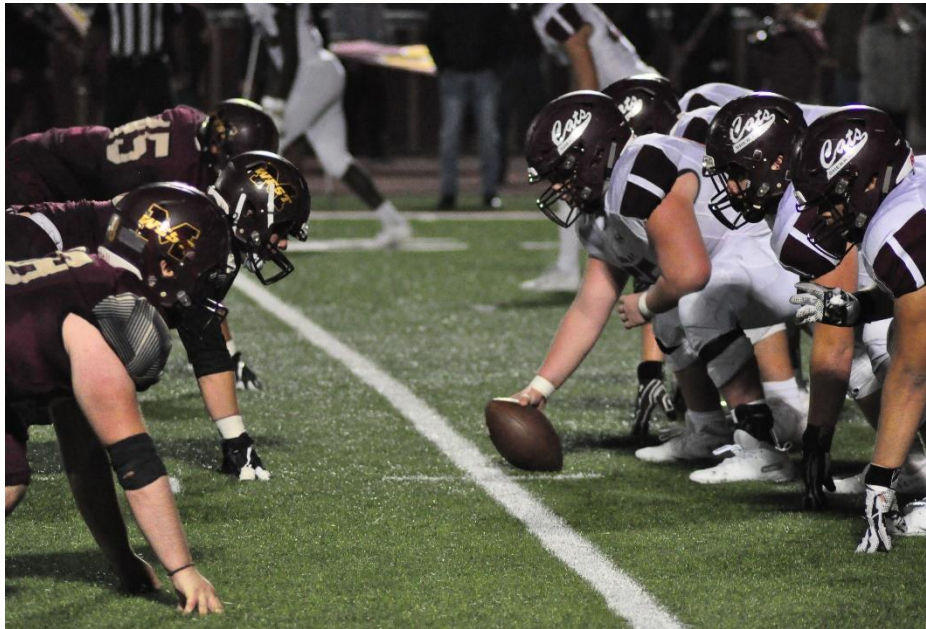
The Sherman offensive line lines up against the defensive line of Magnolia West in their first round match-up

Congratulations to our Sherman High Football team on back-to-back appearances in the UIL State Playoffs. The team traveled over 4.5 hours for their first round match-up against Magnolia West. The Bearcats were down 24-0 early in the 2 nd Quarter before roaring back and responding with 24 unanswered points, led by Blaise Bentsen's two touchdown passes and a fumble returned for a touchdown, going into halftime.